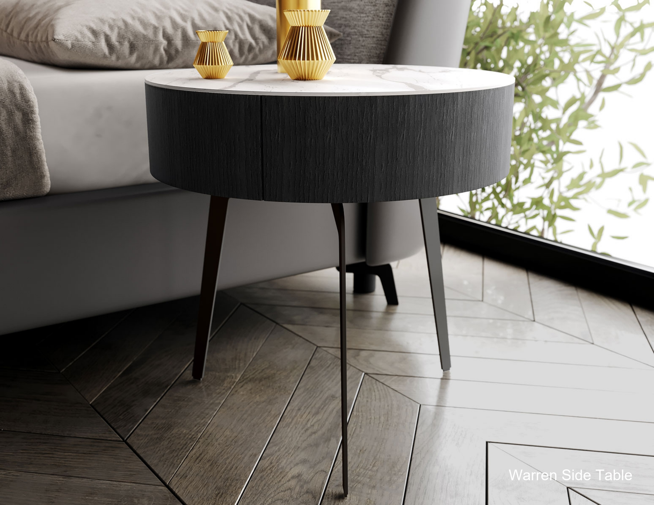
Warren Side Table