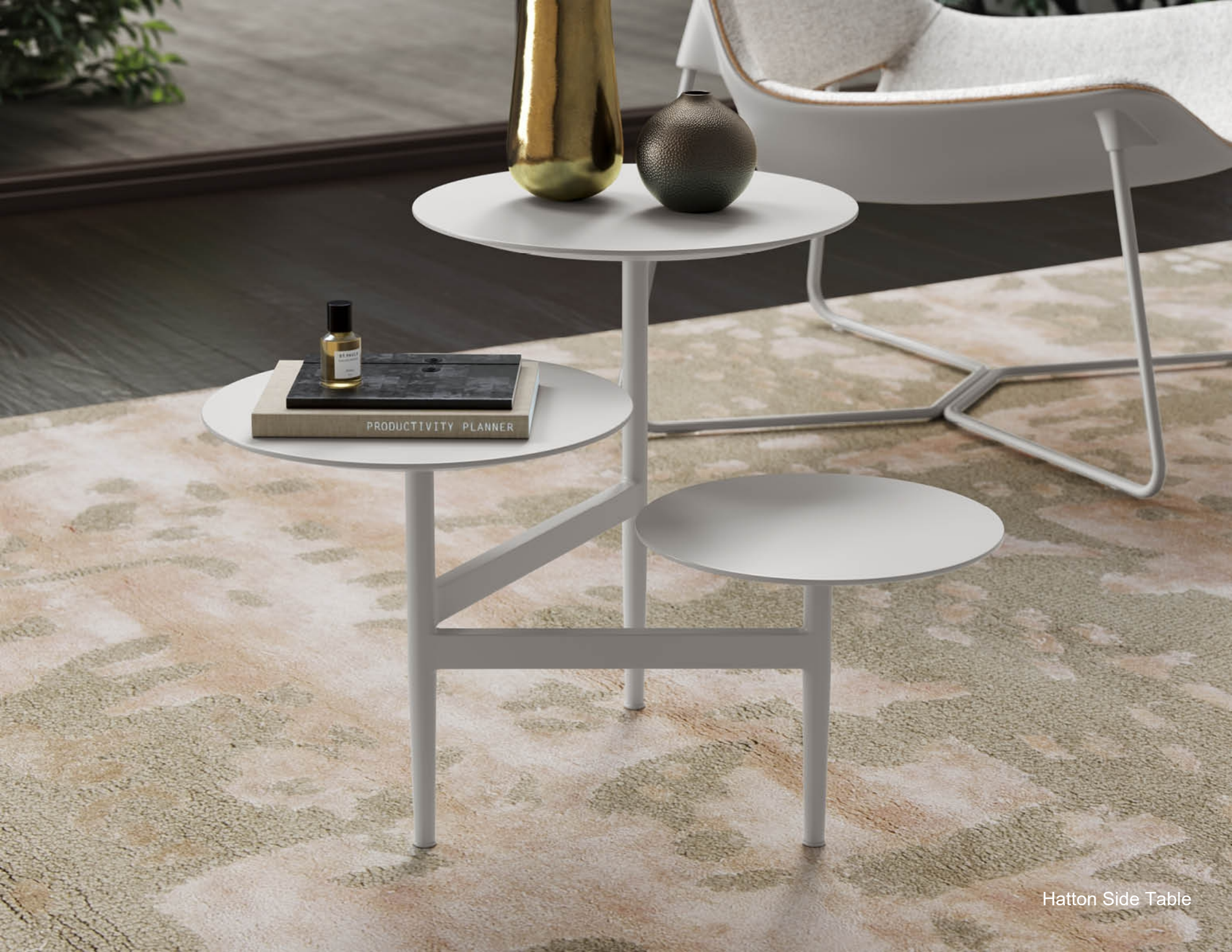
Hatton Side Table