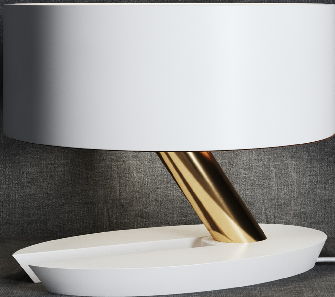
Albion Table Lamp