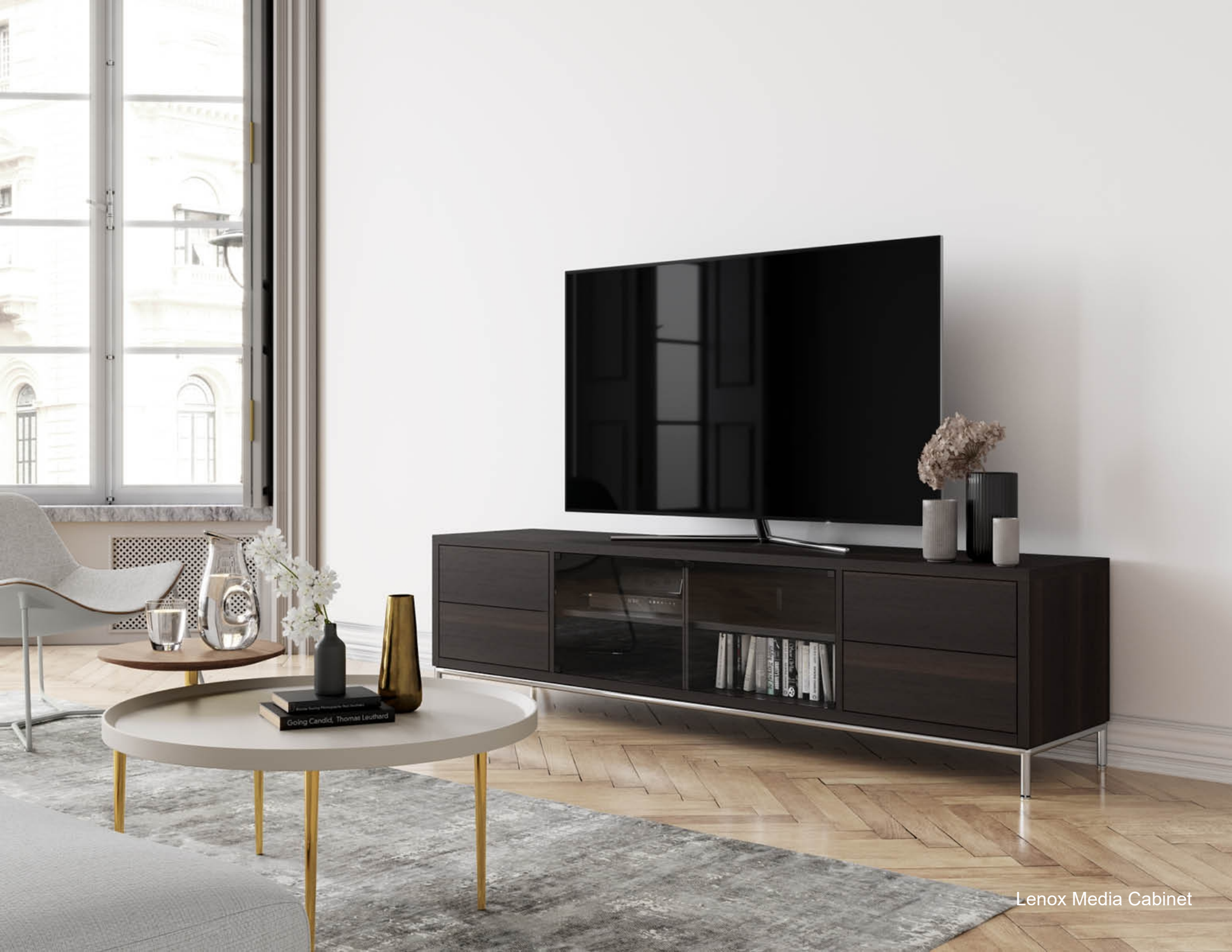
Lenox Media Cabinet