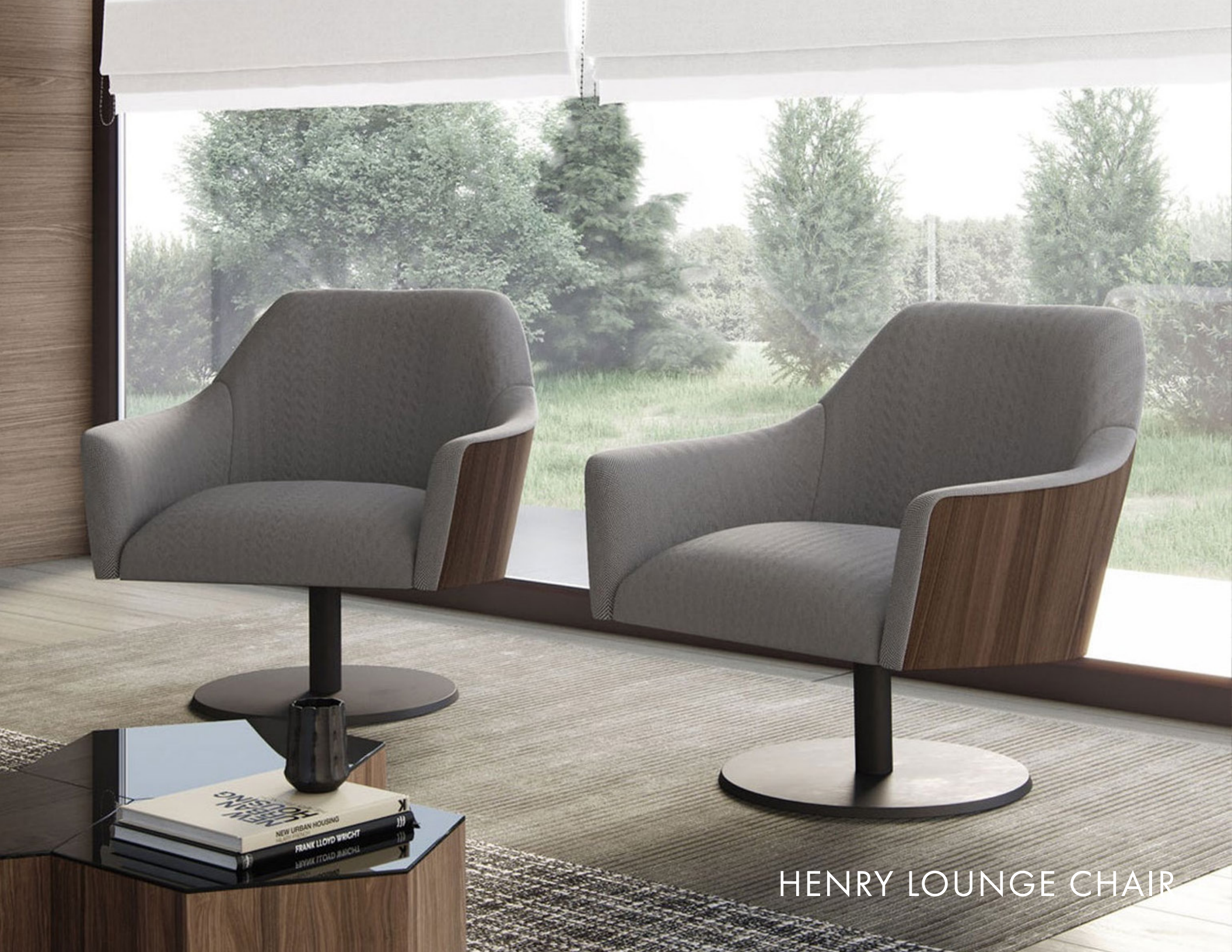
HENRY LOUNGE CHAIR