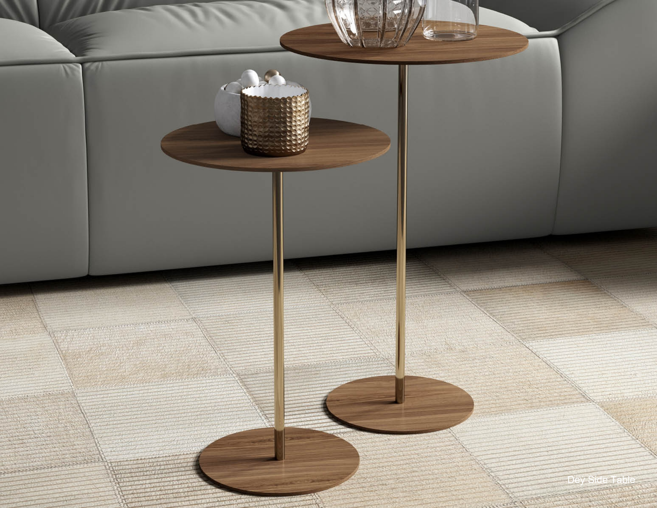
Dey Side Table