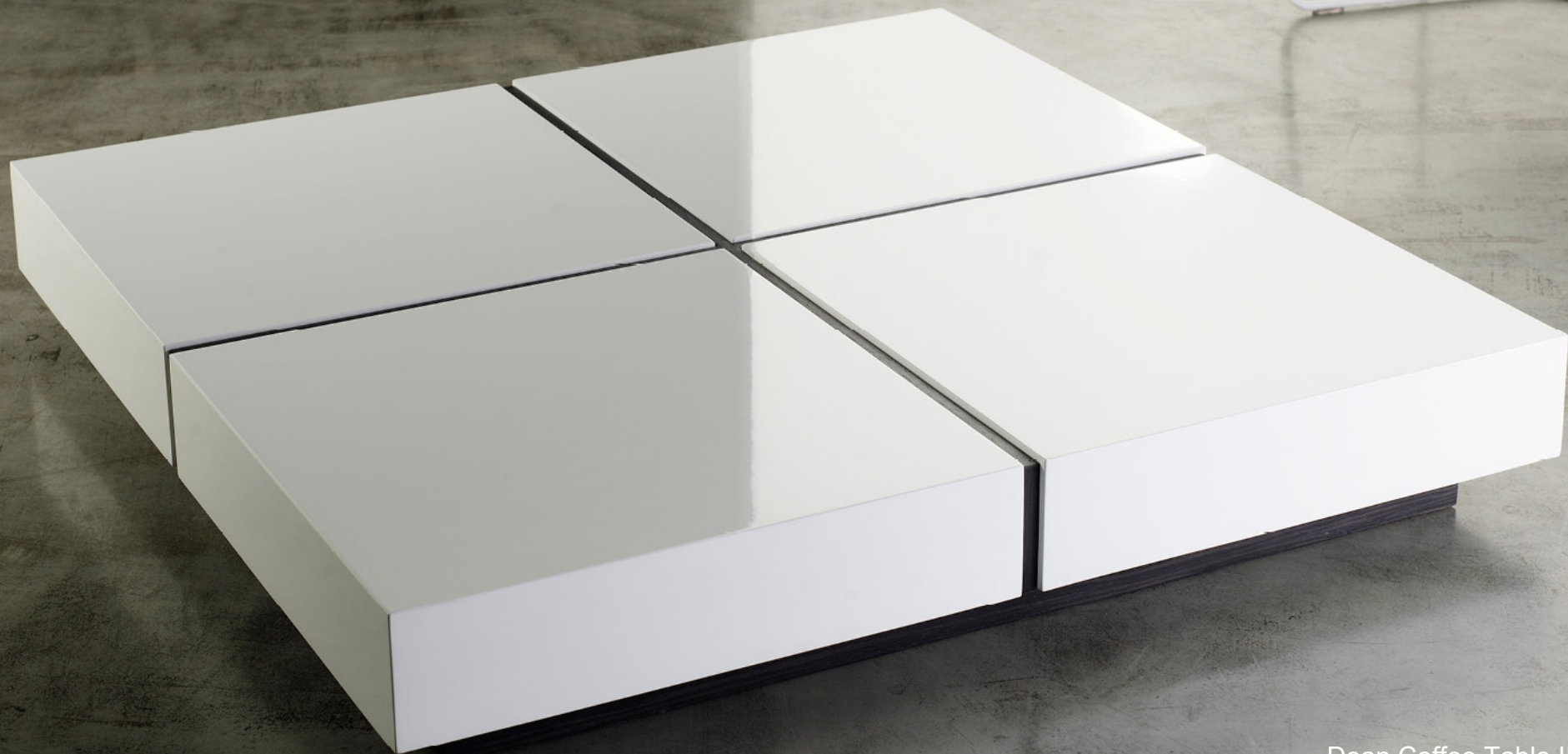
Dean Coffee Table II