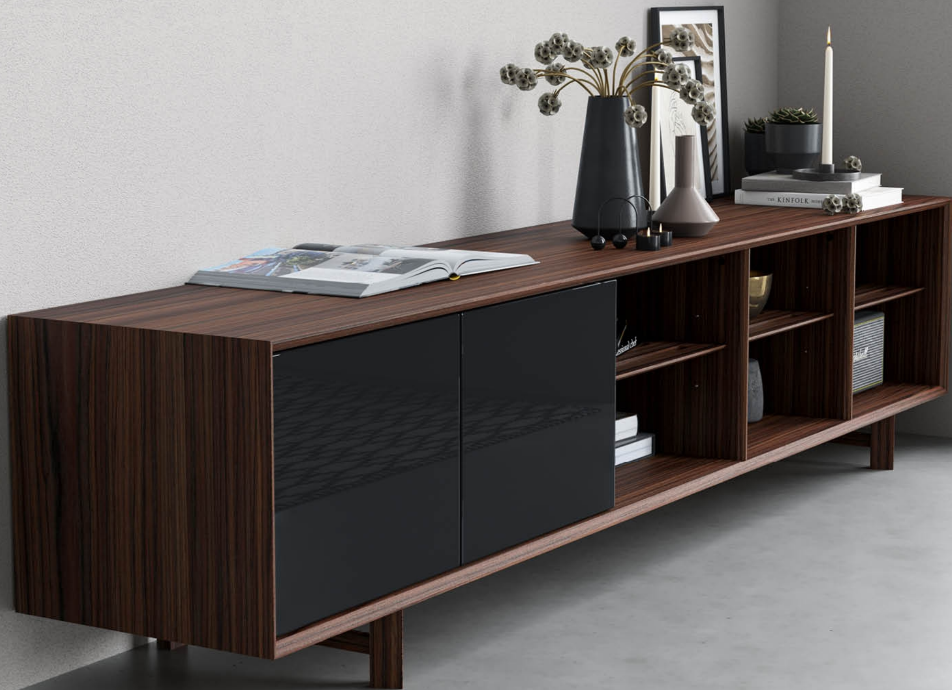
Chiswick Media Cabinet