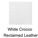
White Crocco Reclaimed Leather